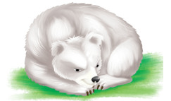
D. polar bear