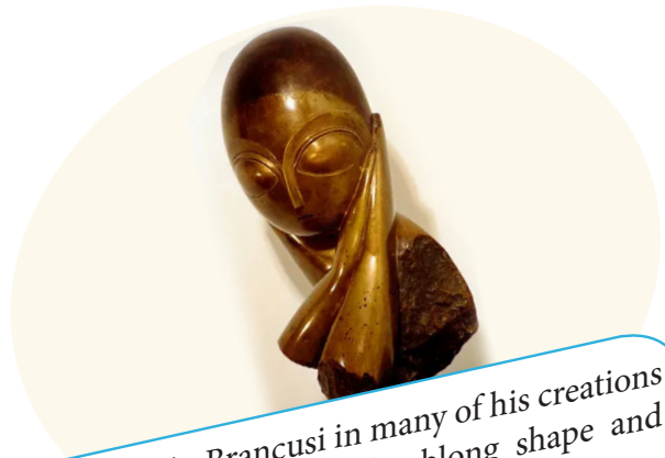
Constantin Brancusi in many of his creations shares the egg's smooth oblong shape and simplicity. .....