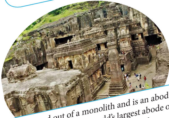
It is carved out of a monolith and is an abode of Lord Shiva. It is the world's largest abode of Lord Shiva and world's largest monolith. .... .....