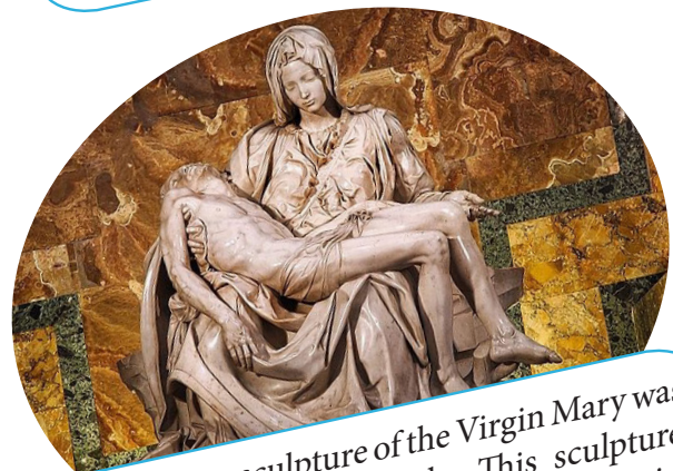
This life-size sculpture of the Virgin Mary was completed by Michelangelo. This sculpture shows her holding of her son in her arms in 1498. .... .....