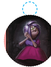
Mad Madam Mim