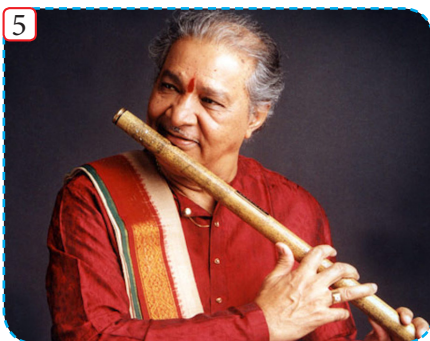
This eminent flutist of India was conferred many prestigious National and International awards.