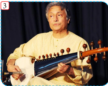
He is an Indian classical musician who plays sarod.