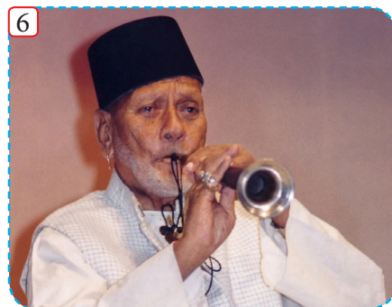
This legendary Shehnai player of India was the third classical musician to be awarded the 'Bharat Ratna'.