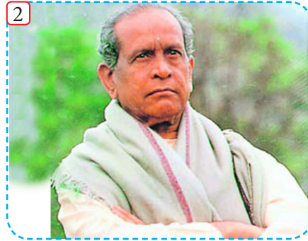
This Indian vocalist in the Indian classical tradition was conferred the 'Bharat Ratna Award' in 2008.