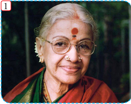
She is acknowledged as the 'Nightingale of Carnatic Music'.