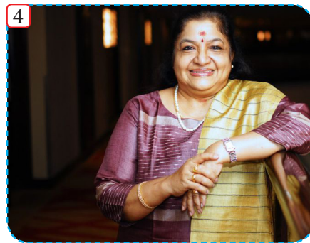
She is the 'Nightingale of South India'.