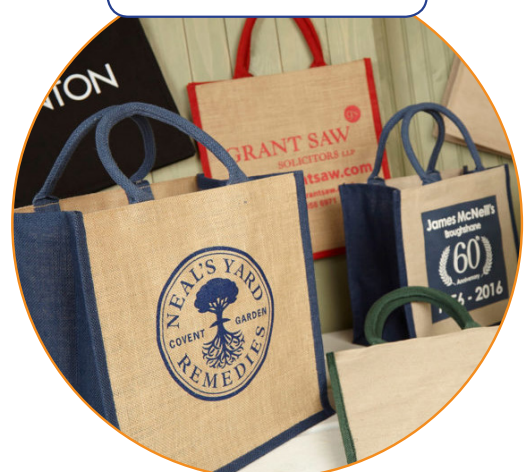
Reduce Plastic Use

Say 'NO' to polythene and use ..... or ..... bags.